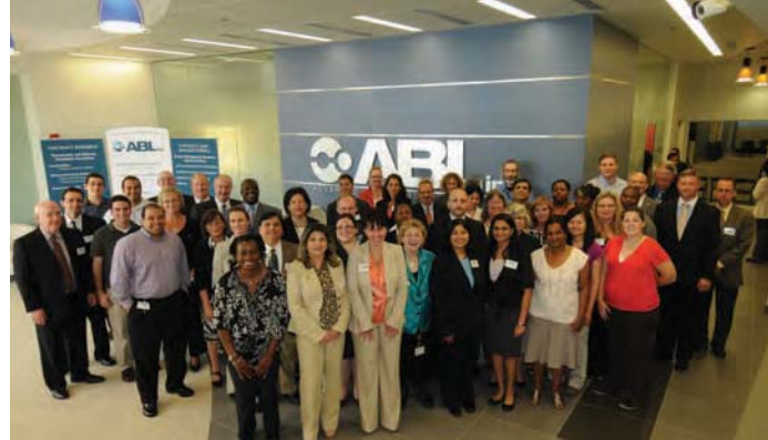
ABL is a leading contract research and manufacturing organization, partnering with our clients to advance their vaccine and therapeutic development programs.

ABL offers strategic services to expand your core competencies for new opportunities with the following expertise: